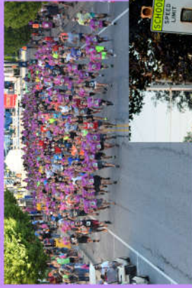
Closed course, band, scream tunnel, goodie bags, refreshments, massages, door prizes

Again this year will be a course record bounty of $100 for male & female who set the fastest time ever in the history of this run.